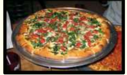
Spinach & Tomato