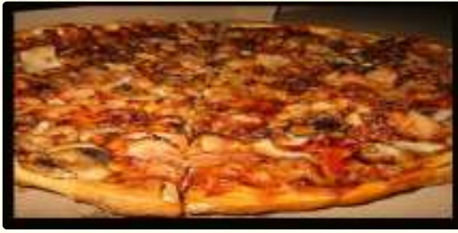
BBQ Chicken Pizza